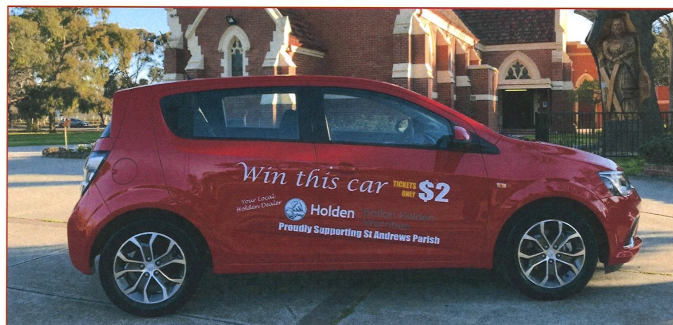
CAR PURCHASED FROM BALLAN HOLDEN AT A DISCOUNTED RATE

Raffle Tickets available from St. Andrew's Parish Office Ph. 9741 4144 or werribee@cam.org.au