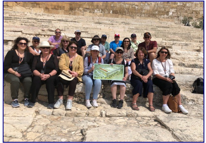
Our Pilgrim Group on the steps at the Temple Mount