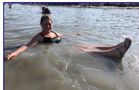
Floating in the Dead Sea

LOST PROPERTY !!! Items in Lost Property will be removed at the end of term, so we encourage families to have a look along our walk way, where they are displayed at the moment to see if any items belong to them.