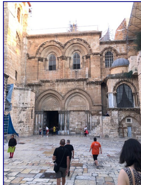
The Church of the Holy Sepulchre